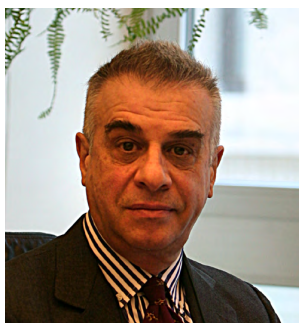
HEAD OF IP&TMT DEPARTMENT

LAW FIRM | IP&TMT DEPARTMENT | PRACTICE AREAS | CLIENTS